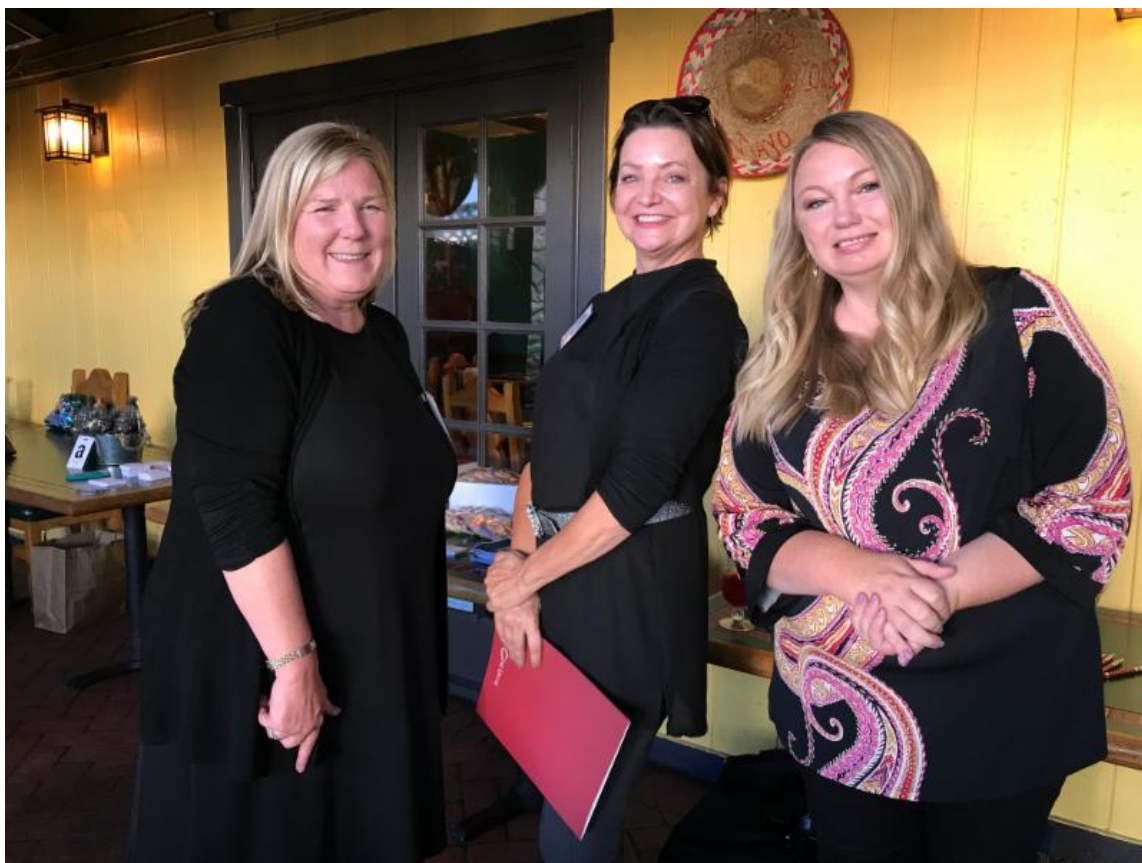
Thank you to One Legal, First Legal, and Aptus Court Reporting for your support!