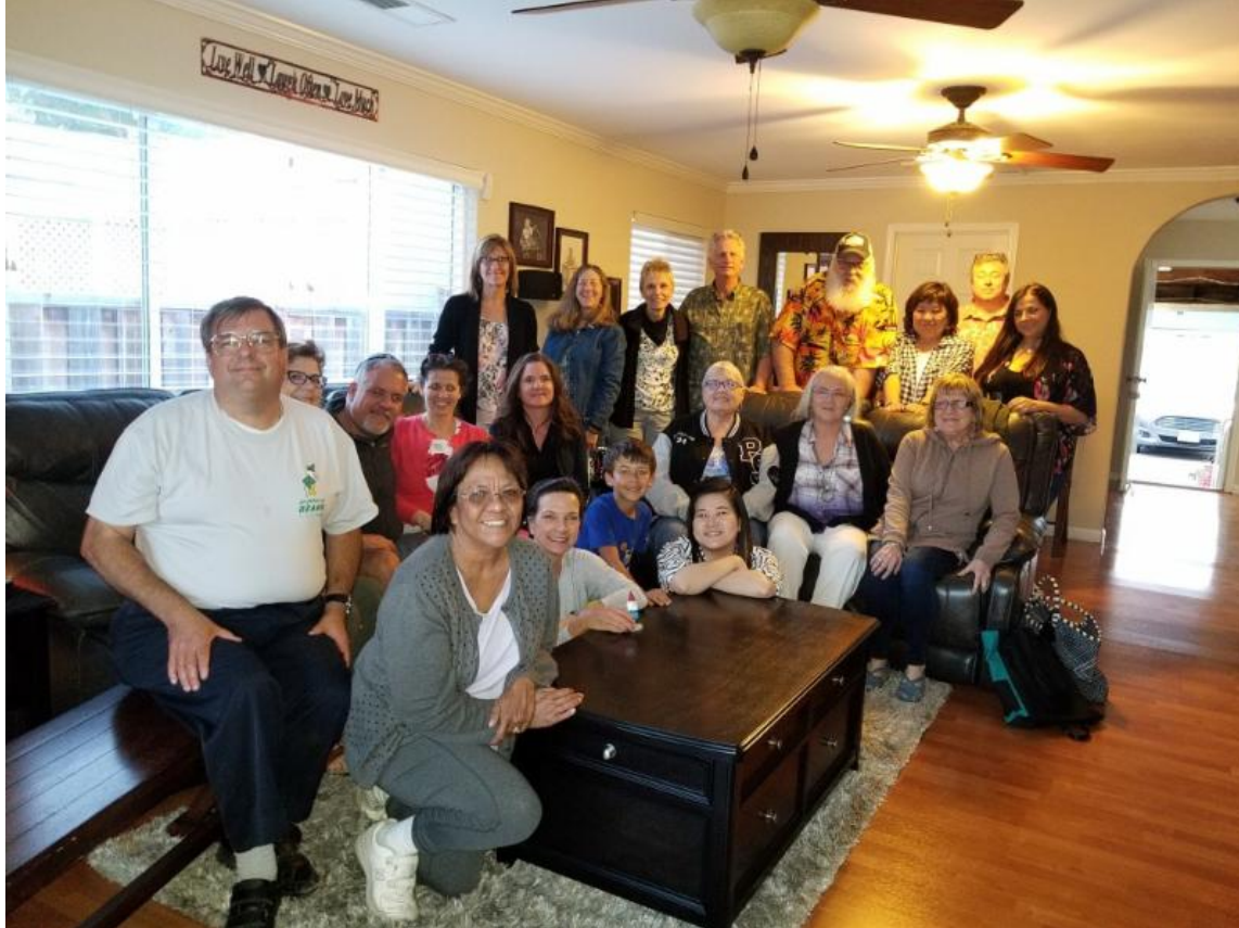
Nice looking group! Thank you all for attending this year!